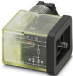
Valve connector, 3-pos., construction B, 1 LED, with protective circuit, screw connection, M16 cable gland

Please be informed that the data shown in this PDF Document is generated from our Online Catalog. Please find the complete data in the user's documentation. Our General Terms of Use for Downloads are valid ( http://download.phoenixcontact.com )